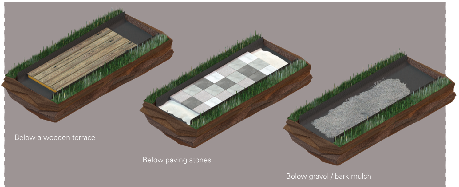
Below a wooden terrace